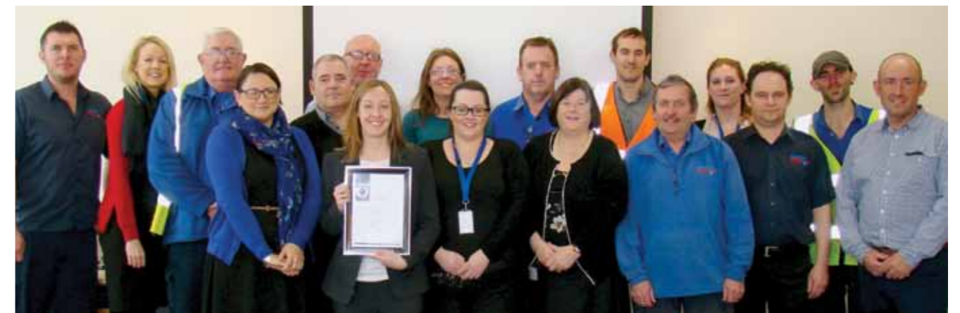
Guernsey Post have been awarded the Investors in People Gold in 2015